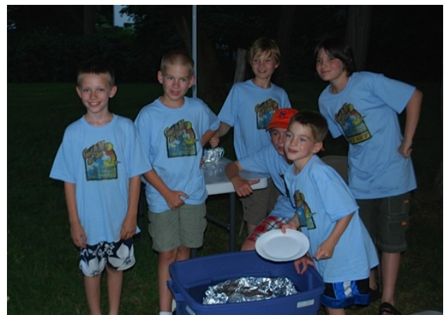
Science project: floating animals in an ark