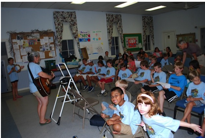
Singing in the cool of Fellowship Hall