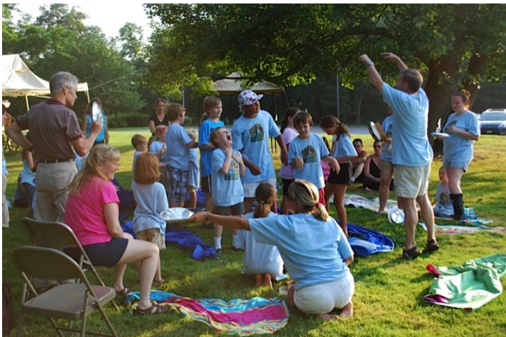
Sailors on the ship with Jonah